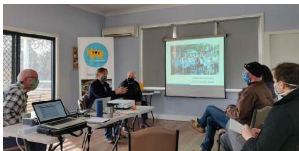
TRY Committee members at a recent COVID-compliant Strategy Session discussing the the best approach for closing the gap to 100% (before Stage 3 restrictions recommenced!)

Late in 2019, the Federal Government, through the Department of Environment and Energy, announced The Regional and Remote Communities Reliability Fund – Microgrids, to support feasibility studies into more reliable, secure and cost-effective energy supply to regional and remote communities in Australia. The program provides funding for feasibility studies looking at microgrid technologies to replace, upgrade or supplement existing electricity supplies in off-grid and fringe-of grid communities located in regional and remote areas.