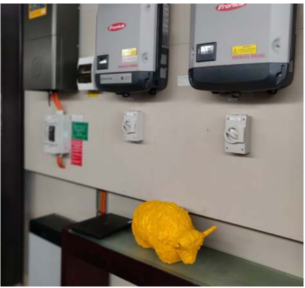
TRY's Golden Yak below the Fronius inverters at the launch of the Virtual Power Plant in the Yack Public Hall

Well wishes to all you, and we trust you are coping with the extraordinary times we are enduring. The social distancing reminds us how important it is to look after the people close to us, those living near to us and the most vulnerable. Fortunately, TRY is just another example of a growing global trend – celebrating the power of 'local.'