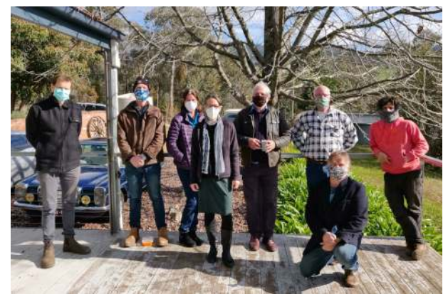
Participants of one of two TRY Strategy Sessions in early August enjoy the 100% renewable sunshine before heading home